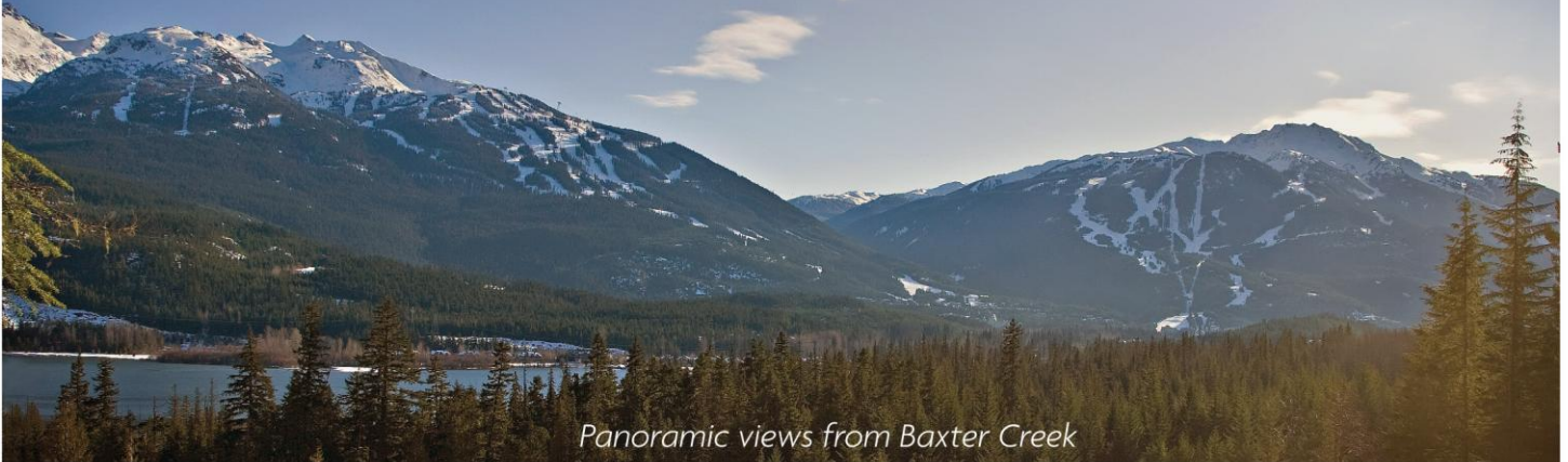
Panoramic views from Baxter Creek